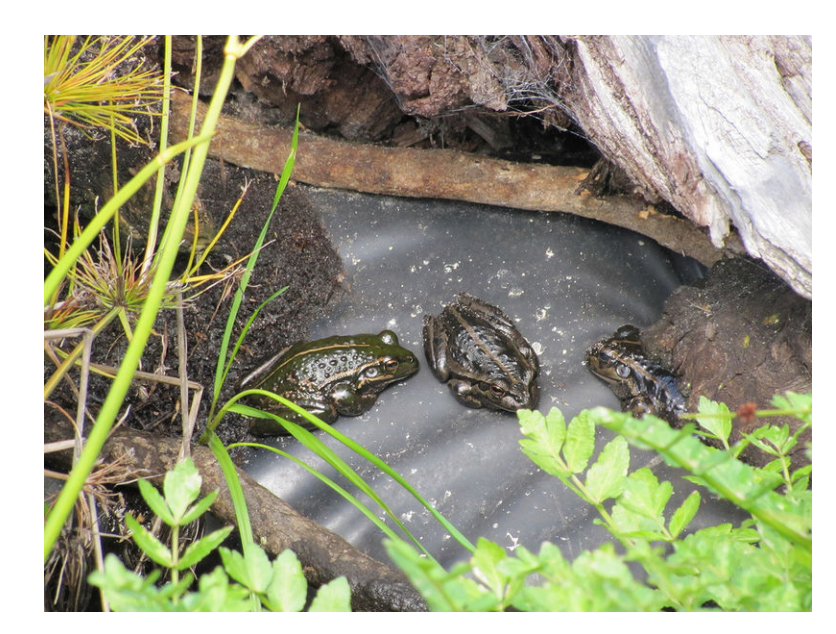
FIGURE 1.3 A pond with frogs.