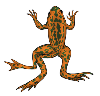
FIGURE 1.2 A frog with an extra leg.

extra eyes, or no eyes. One frog even has limbs coming out of its mouth. These are your observations , or things you notice about an environment using your five senses.