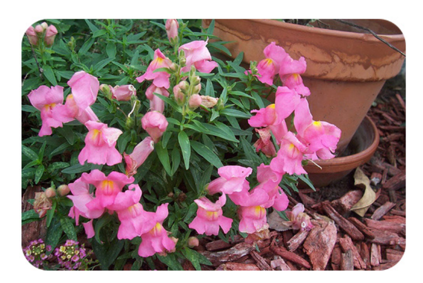
FIGURE 1.1 Pink snapdragons are an example of incomplete dominance.

A plant that is homozygous for the red allele (RR) will have red flowers, while a plant that is homozygous for the white allele will have white flowers (WW). But the heterozygote will have pink flowers (RW) ( Figure 1.1 ) as both alleles are expressed. Neither the red nor the white allele is dominant, so the phenotype of the offspring is a blend of the two parents.