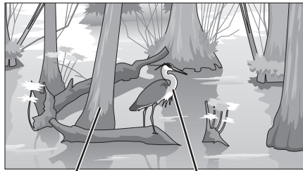
Trees and vines are important producers in swamp ecosystems.

A swamp is a wetland in which trees and vines grow. Swamps form in low-lying areas and near slow-moving rivers.