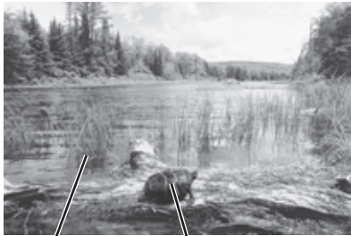
Grasses and other small plants are the main producers in marsh ecosystems.

A marsh is a treeless wetland. Marshes form along the shores of lakes, ponds, rivers, and streams.