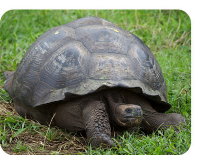
Tortoise with dome-shaped shell