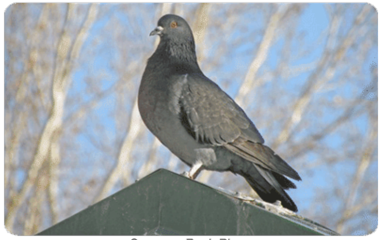
Common Rock Pigeon