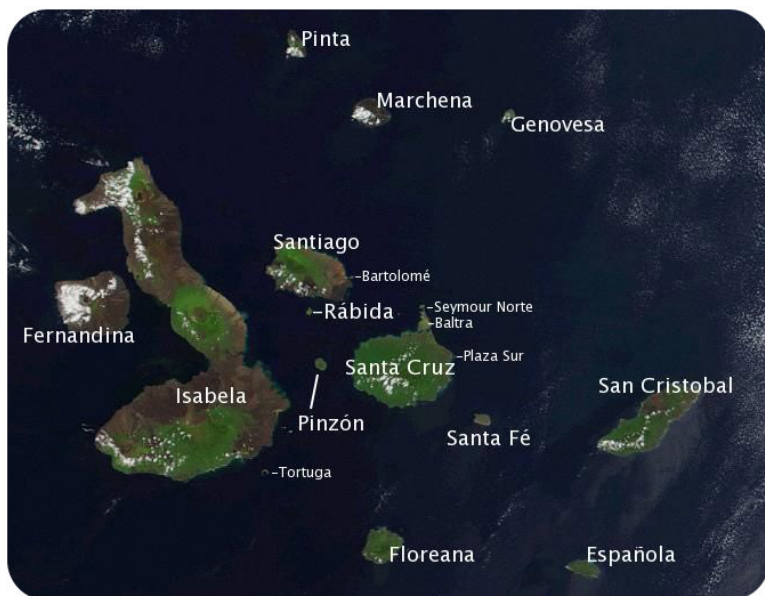
FIGURE 1.3 The Galápagos Islands are a group of 16 volcanic islands 600 miles off the west coast of South America. The islands are famous for their many species found nowhere else. It was on these islands where Darwin began to develop his theory of evolution.