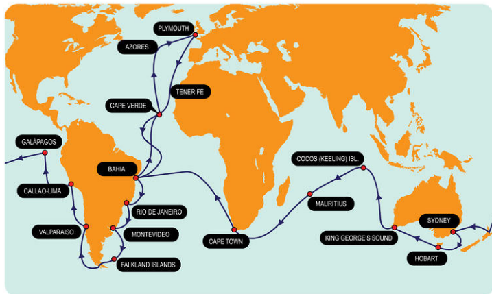
FIGURE 1.2 Charles Darwin's famous five year voyage was aboard the HMS Beagle from 1831-1836.